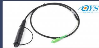
H optic with round drop cable