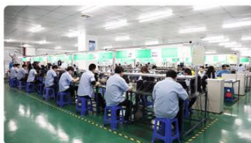
FTTA Cable Assembly Workshop