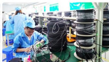
FTTH Cable Assembly Workshop