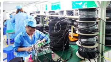
FTTH Cable Assembly Workshop