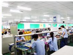
Patch Cord Workshop