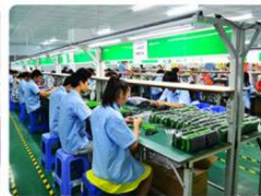
Fast Connector Workshop