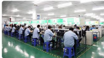
FTTA Cable Assembly Workshop