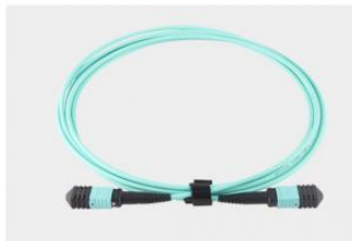
MPO/MTP-MPO/MTP (8 Core, 12 Core, 24Core)