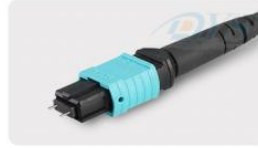
MPO male with pins