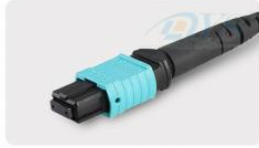
MPO female without pins