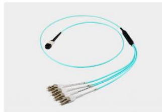
MPO/MTP-LC (8 Core)