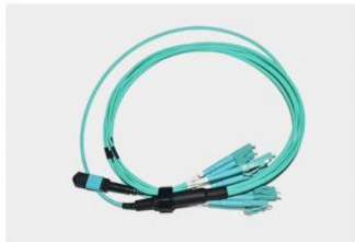
MPO/MTP-LC (12 Core)