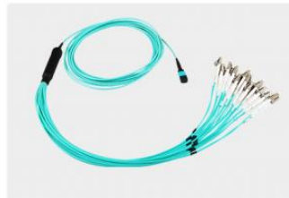
MPO/MTP-LC (24 Core)