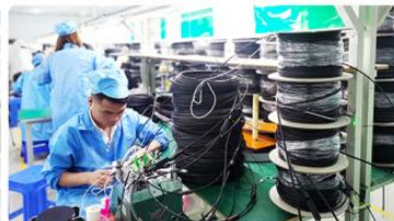
FTTH Cable Assembly Workshop