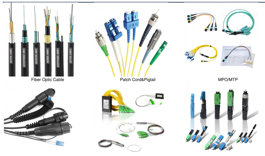
FTTX Cable Assembly