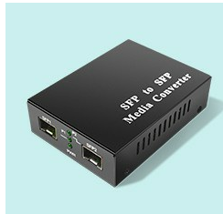
DYS-GAS-2 Media Converter