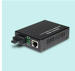
10/100/1000M Media Converter