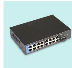
10/100/1000M 1 Fiber Port 16 RJ45 Media Converter