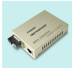
DYS1100SS Serial Media Converter