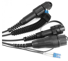
FTTX Cable Assembly