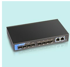
10/100M 8 Fiber Port 2 RJ45 Media Converter