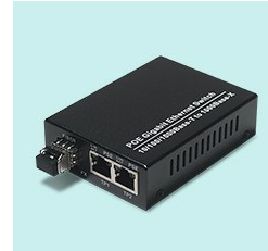
POE 10/100/1000M 2 RJ45 Port Media Converter