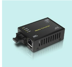
MINI 10/100/1000M SC Media Converter

Industrial Temperature Media Converters for equipment in -40C to +75C operating temperatures