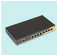
10/100/1000M 1 Fiber Port 8 RJ45 Media Converter