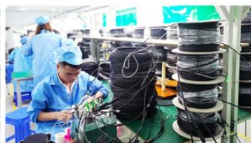
FTTH Cable Assembly Workshop